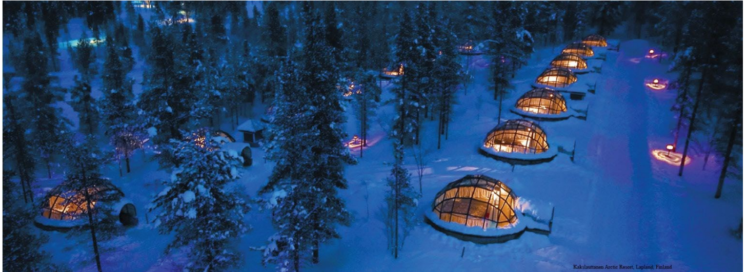
Kakslauttanen Arctic Resort, Lapland, Finland